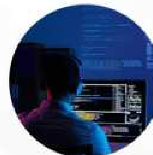
Special Project Developers