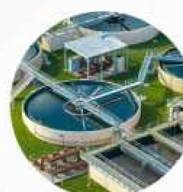
Water & Industrial Water Treatment