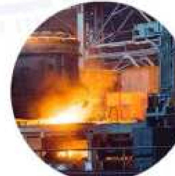
Machinery & Metallurgical