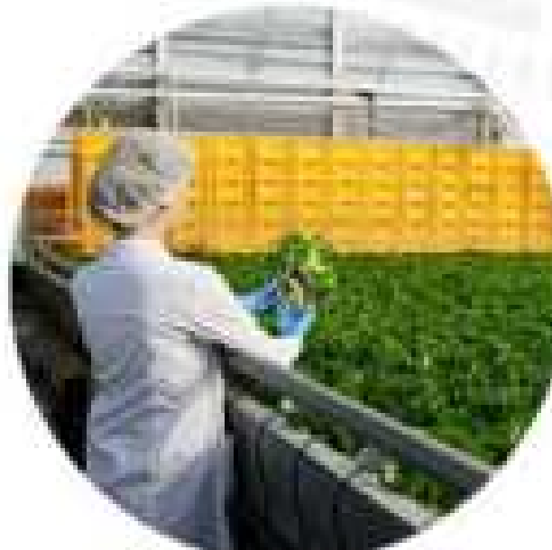
Food & Agro Processing