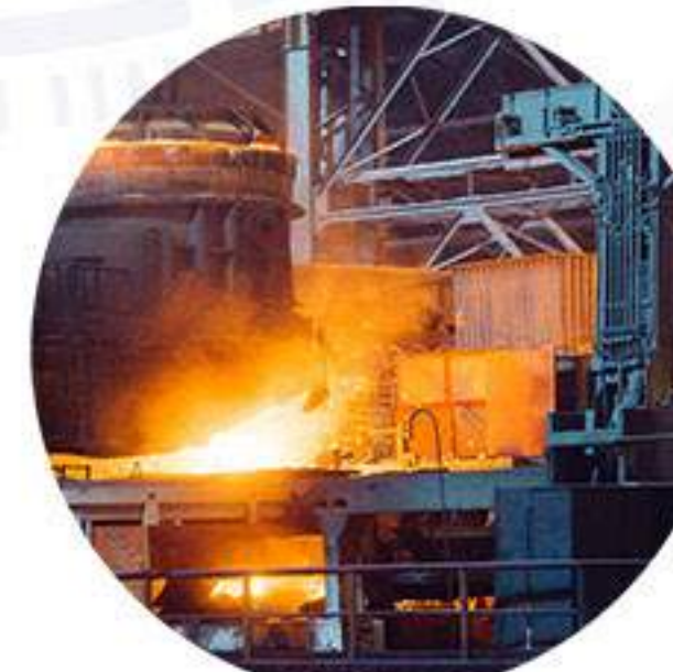
Machinery & Metallurgical