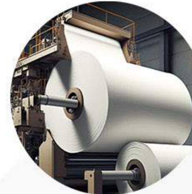
Pulp & Paper