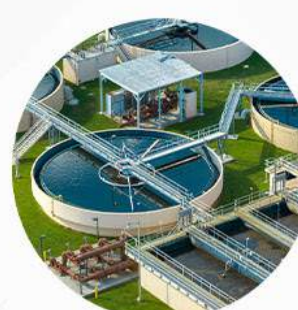
Water & Industrial Water Treatment