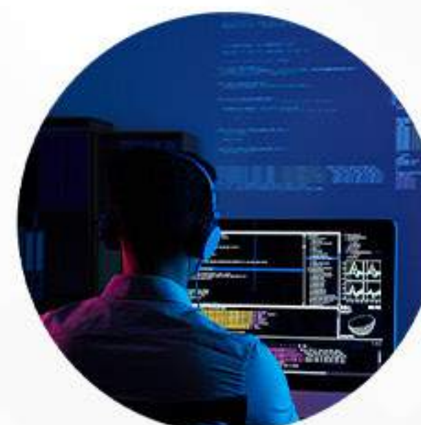
Special Project Developers