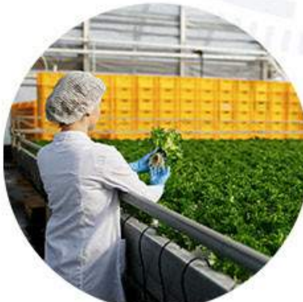
Food & Agro Processing